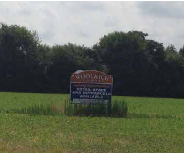
Woolwich Commons, the first phase of major retail development in the Center.