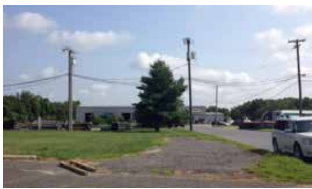
Present industrial park.